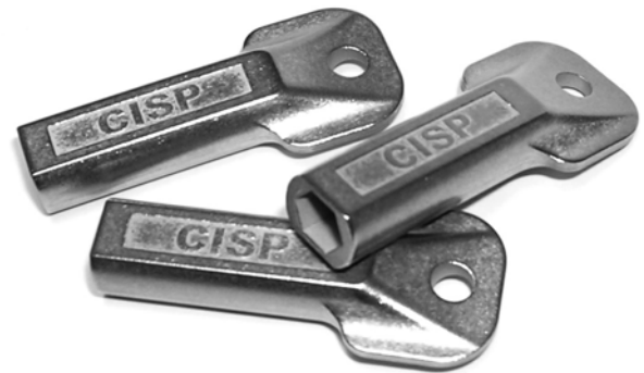
Figure 1. Example of PIM parts after sintering.

*contact author:e-mail: dfh100@psu.edu Tel.814-865-7346