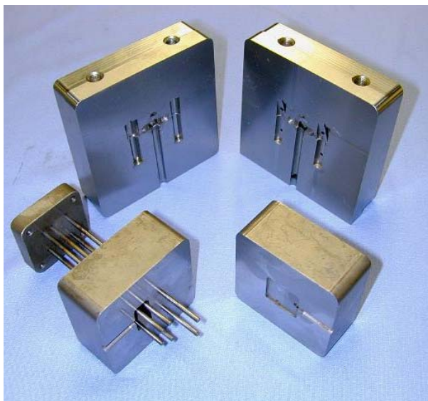
Figure 4. Example of Prototype tooling. No details requiring slides or cams are on the part

Once a PIM prototype part has passed initial qualifications for use, the next step is to ensure that a process is sufficiently in control for a particular application. Minimum process control is required if the specifications are